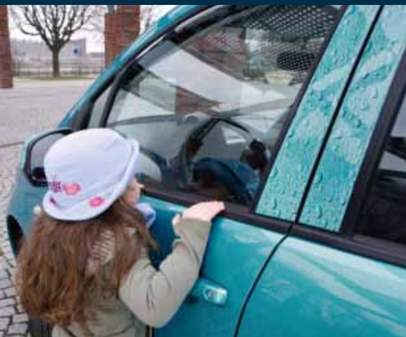
B-pillar foil 4 pieces, turquoise drop design Part No. 990E0-51K40-000