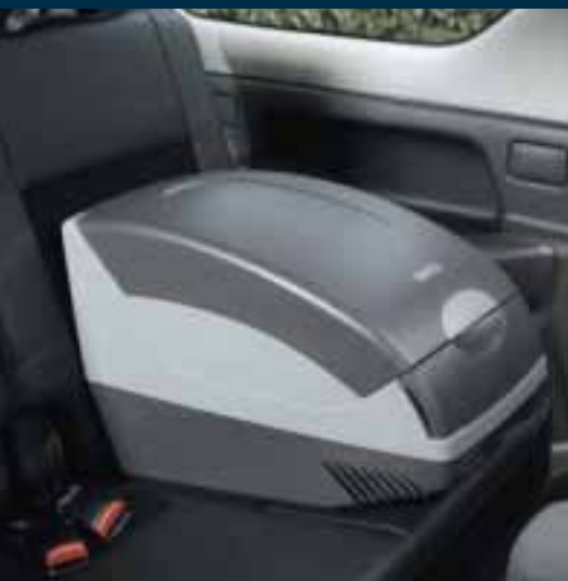
Cooler capacity 15 l (ill. shows Jimny) Part No. 990E0-64J30-000