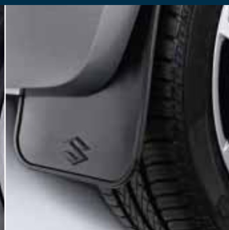
Mud flap set 1 rigid, front, can be painted in body colour (no ill.) Part No. 990E0-51K07-000