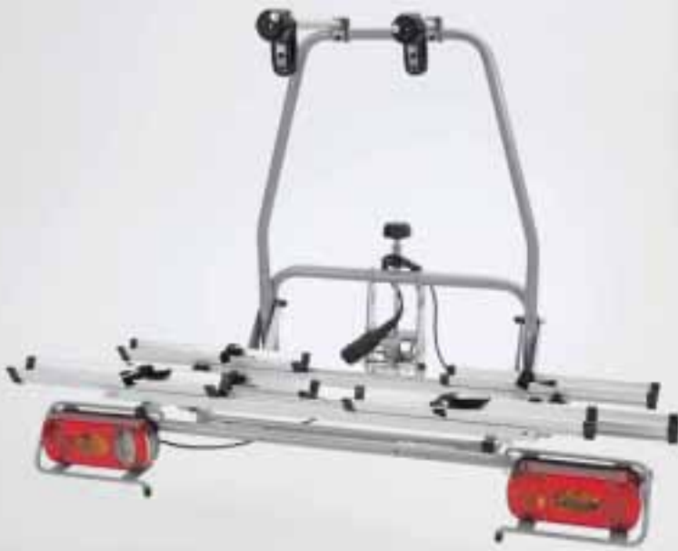
Bike carrier "Vario" for up to 2 bikes, aluminium rails, only in combination with tow bar Part No. 990E0-62J67-000

On top of the Splash's convenient roof accessories and impressive loading space, it holds a whole range of extra elements in store. Whether you're looking for rear carriers for sports equipment such as bikes and boards or tow bars that will let you extend your transportation possibilities as you require, the Splash gives you more than enough uncomplicated ways to take along whatever you may need without sacrificing passenger comfort. And without making compromises.