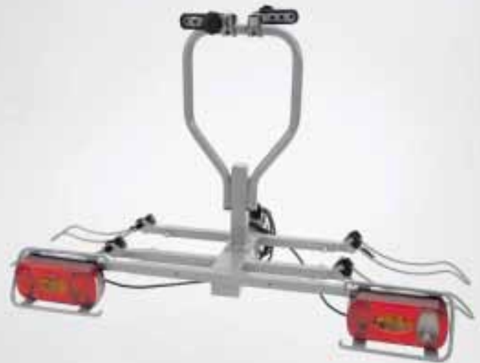
Bike carrier "Carac" for 2 bikes, steel, only in combination with a tow bar Part No. 990E0-62J66-000