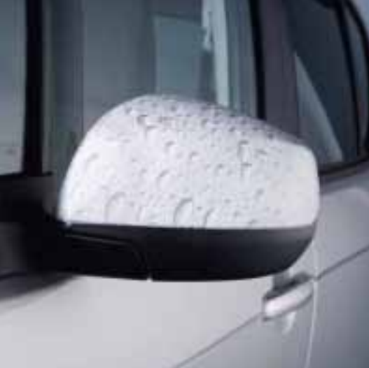
Door mirror cover silver drop design, 2 pieces Part No. 990E0-51K35-000