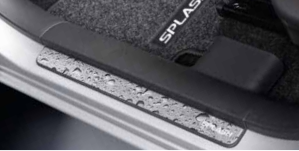
Door sill guard set silver drop design, 4 pieces Part No. 990E0-51K57-000