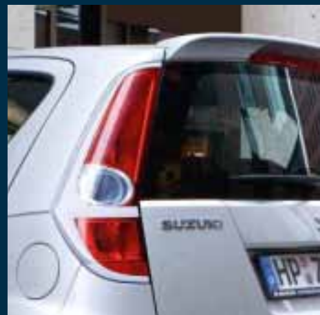
Tail lamp Bezel unprimed; we recommend to paint the parts in body colour Part No. 990E0-51K29-000