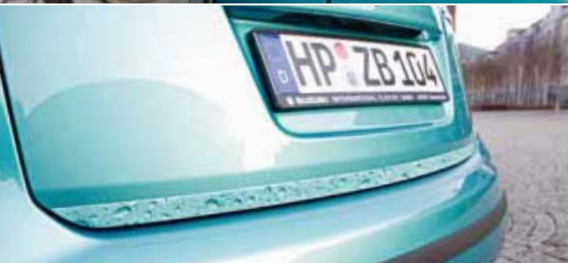
Rear hatch moulding turquoise drop design Part No. 990E0-51K30-000