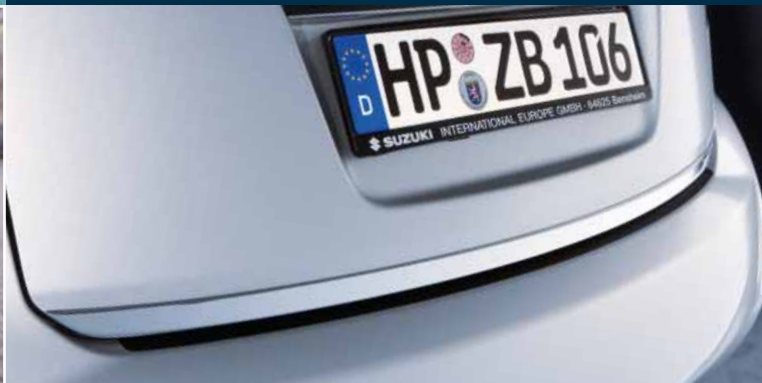
Rear hatch moulding silver drop design (no ill.) Part No. 990E0-51K32-000