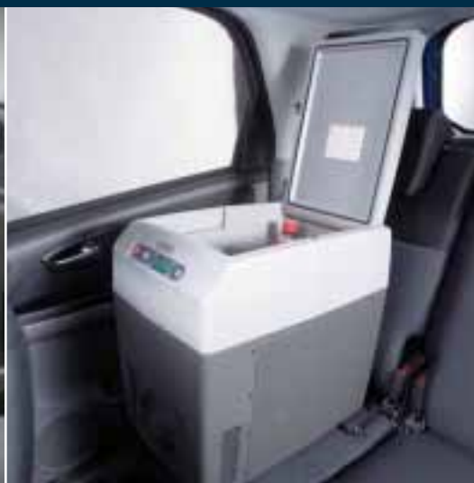
Cooler with ISOFIX fastening, capacity 21 l (ill. shows SX4) Part No. 990E0-64J23-000